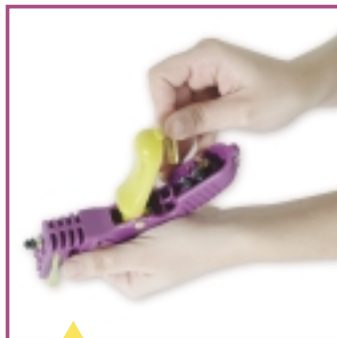
Storage place for blades and inserters