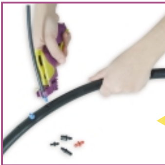
Inserting spaghetti piping with connector into main pipe